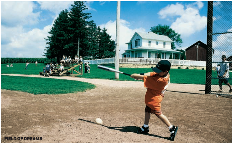
FIELD OF DREAMS

A bit farther north, you'll find DUBUQUE (dubuquechamber.com), the quintessential go-at-your-own-pace river town. Try sailing or strolling along the Mississippi River; in colder months, sleigh rides and ice-skating are local specialties. Baseball buffs should consider a trip to nearby Dyersville, where the original FIELD OF DREAMS (fieldofdreamsmoviesite.com) movie site, a ballpark carved in the middle of a cornfield, has been preserved and is perfect for a free pickup game.